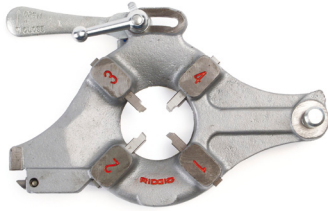
Model 541 Model 542