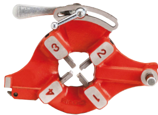
Model 713 Model 913